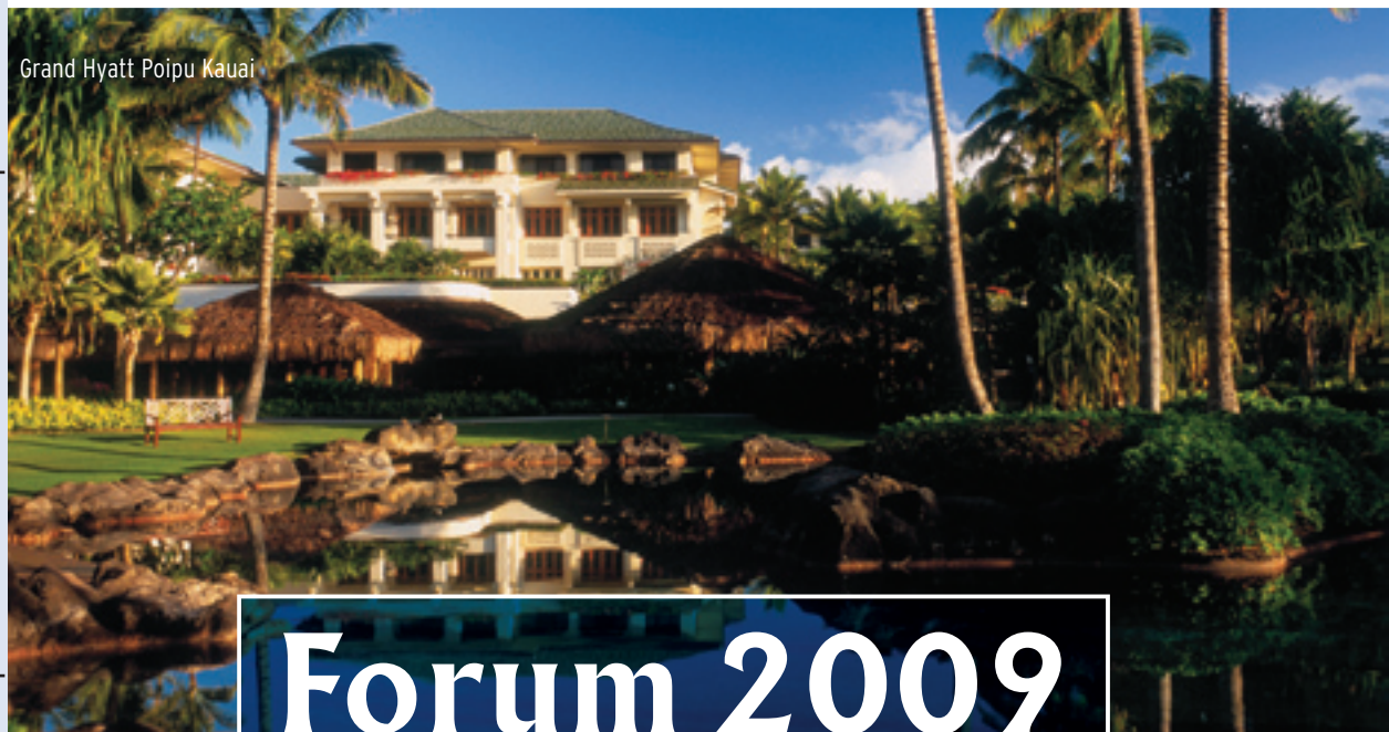
Grand Hyatt Poipu Kauai